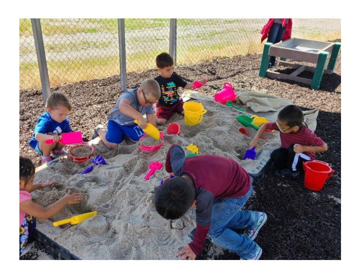
The Head Start Program

Policy Council and Board of Education continue to make a positive difference in the lives of children and families in the communities that we serve.